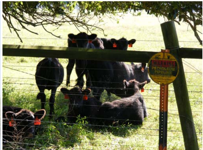
Cows with a "pipeline crossing" sign