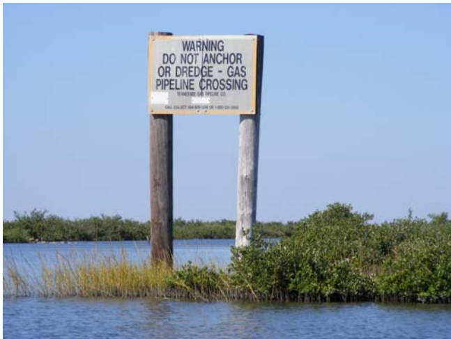
A gas pipeline sign in the middle of the bayou.